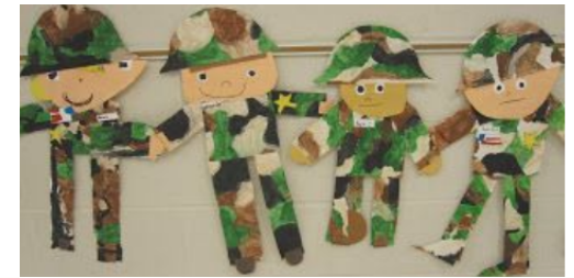
Create a picture of a soldier