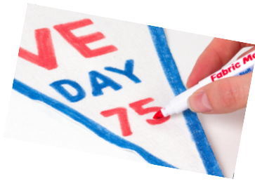
Make your own flag