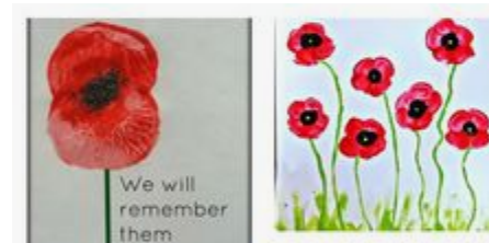
Create a poppy picture