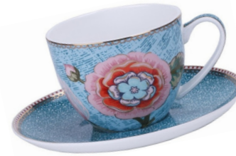
Design your own teacup